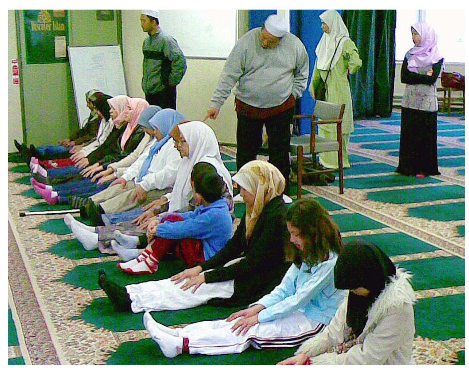
A screening session in progress for a group of Malaysian students and their kin in Manchester, England.